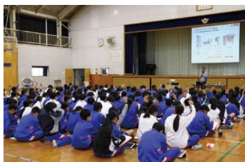
Visiting lecture focusing on agriculture and SDGs

We conduct food and agricultural education for the next generation through activities such as holding drawing contests, exhibiting products at food and agricultural events, and holding visiting lectures.