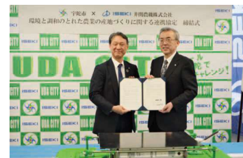
Partnership agreement with Uda City, Nara Prefecture on creation of production areas for agriculture in harmony with the environment

We conduct activities to contribute to the realization of sustainable agriculture through initiatives in collaboration with local governments and other partners throughout Japan.