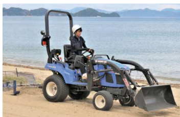
Beach cleaning using tractors and specially made implements

We conduct cleaning activities in local communities and at our offices as part of corporate citizen activities oriented to the local community and environmental education for employees.