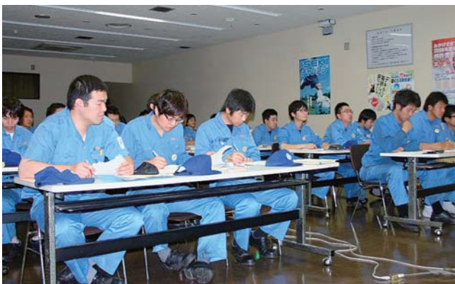
Lecture for environment

We realized that the first step to the environmental preservation is to raise the awareness of each employee about the environment through the environmental training of new employees and issuances of Iseki Group newsletters.