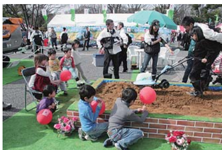
Yoyogi park event corner

Many visitors were interested in our exhibitions corner where we displayed the panels introducing our approaches to “local production and local consumption” activity and approaches to low cost agriculture and plant factory as a partner of FAN promoting team as well as handing out balloon with a logo “FAN”, implementing PR for promoting FAN activity and showing DVD of promotion and improvement of rice powder consumption. We also had a photo session with the tractor which had driven around Tohoku region for PR of FAN activity in September 2009. In order for the visitors to feel more familiar to “agriculture” and “food”, we set up a corner at which they were able to handle electric mini tiller “ERENA” and/or “ASUNA” suitable for home garden. Many children seemed to be more interested in driving the cultivators than adults. There were huge queues of people form in front of the corner for the driving the cultivator. This event proved to be very popular. From now on, Iseki is going to participate events for foods through FAN activity for giving more information to consumers.