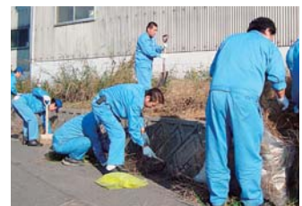
Iseki-Houei MFG. Co., Ltd.