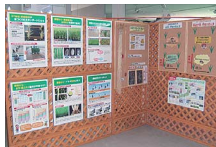
FOOD ACTION NIPPON corner