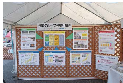
FOOD ACTION NIPPON corner