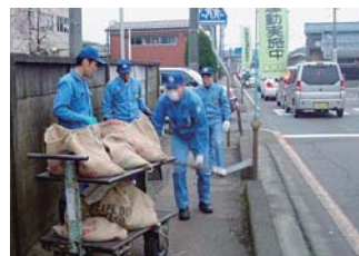
Iseki-Niigata MFG. Co., Ltd.