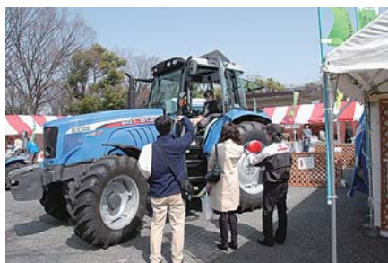
Yoyogi park exhibition corner