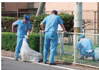
Iseki-Matsuyama MFG. Co., Ltd.

As part of “Contribution to society and community”, which Iseki Group presents as our environmental policies for each district, our employees participate in cleaning activities in their district.