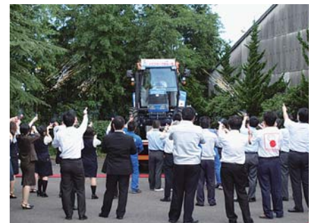
Company members greeted the tractor arrived at the destination after driving around Tohoku region.