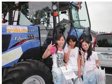
Photo with FAN