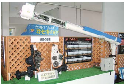
Renewed Exhibition Pavilion

In the company cafeteria of Iseki-Kumamoto MFG. Co., Ltd., a corner for “local production for local consumption” is set up for offering some dishes using local food such as “Katsu-don” (deep-fried pork on rice) and salad. Set meals using local foods only are on the menu on every 3rd Friday for promoting improvement of the local production for local consumption activity and food self-sufficient ratio.