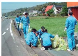
Iseki-Kumamoto MFG. Co., Ltd.