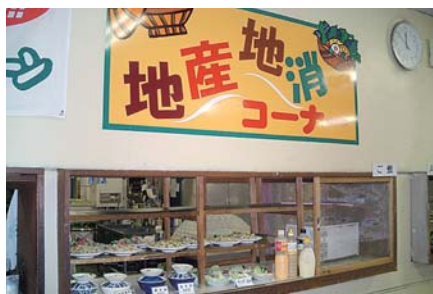
Local production for local consumption corner