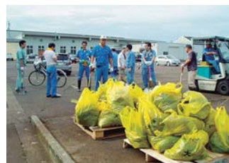
Iseki-Niigata MFG. Co., Ltd.