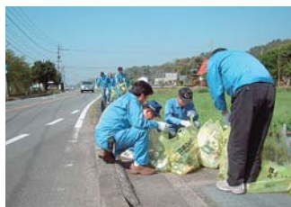
Iseki-Kumamoto MFG. Co., Ltd.