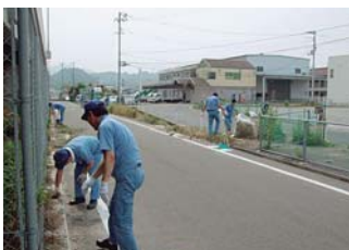
Iseki-Matsuyama MFG. Co., Ltd.

As part of our practices regarding “Contribution to society and community”, which Iseki Group presents as our environmental policies for each district, our employees participate in cleaning activities in their district.