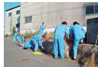
Iseki-Houei MFG. Co., Ltd.