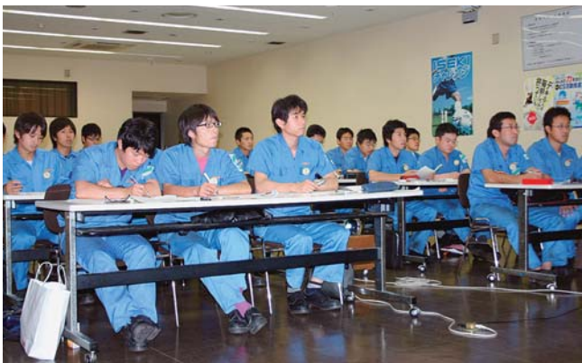
Lecture for environment

Iseki Group realizes that the first step to the environmental preservation is to raise the awareness of each individual; therefore, we support their activities to promote the environment preservation not only in their workshops but also in their home and community. Iseki Group strives to further increase the awareness of each employee about the environment through the environmental training of new employees and issuance of Iseki Group newsletters.