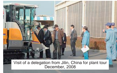
Visit of a delegation from Jilin, China for plant tour December, 2008