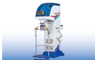
Weighing and separating machine