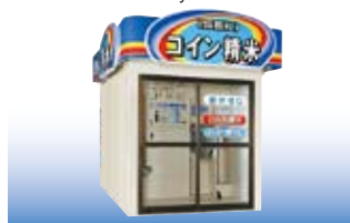
Coin-operated rice milling machine